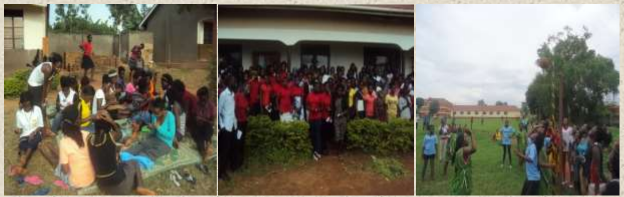
Young people at the Masooli center