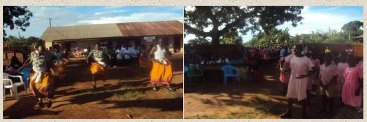
UYDEL students and school students' perform during a school outreach