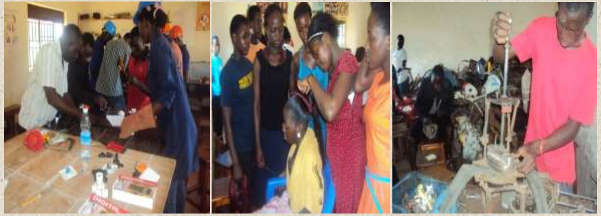
Some of the skills at the center include; electronics, hairdressing and motorbike engineering

However, it's not always easy because there is continuous break down of equipment like machines used in welding, knitting, sewing machines and many others and yet the number of students they cater to is constantly increasing.